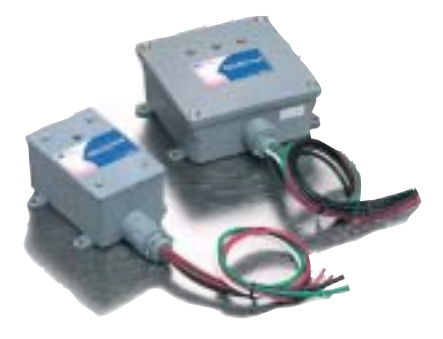
Whole-house surge protection is available; check warranty for connected devices. A qualified electrician should install this device.

Whole-house surge protection is available; some of these devices come with warranties, but read the fine print to see what is covered and what is not. Usually your white appliances are covered, such as your stove, refrigerator, and furnace. There is now a device for a well; this is a new product. A qualified electrician should install these types of devices. When you have a whole-